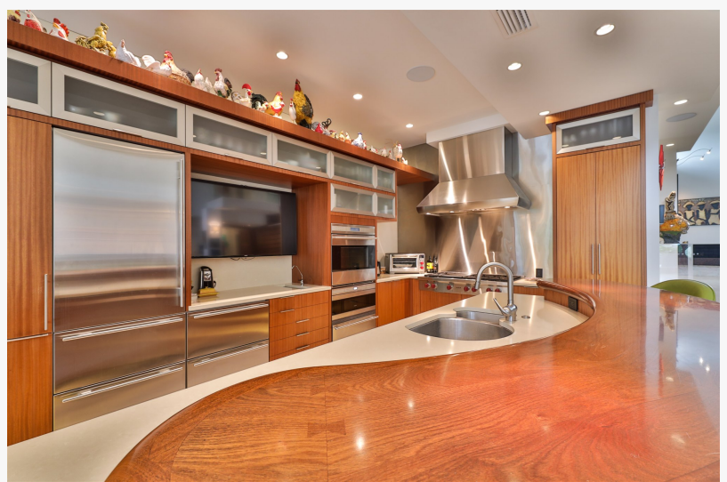
Relaxing in the Main Kitchen at 1006 S Riverside Drive

between inside and out. This unity with nature is enhanced by a custom 22 foot tall window that faces the Intracoastal. It boasts a red divided light frame that evokes a similar feature on Frank