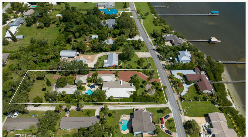
Exterior Aerial View of 1006 S. Riverside Drive