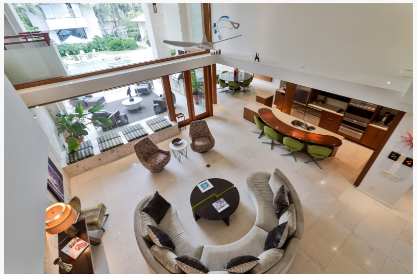
Balcony view of the living area at 1006 S Riverside Drive