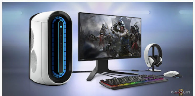
On the desktop of the Esports Pod