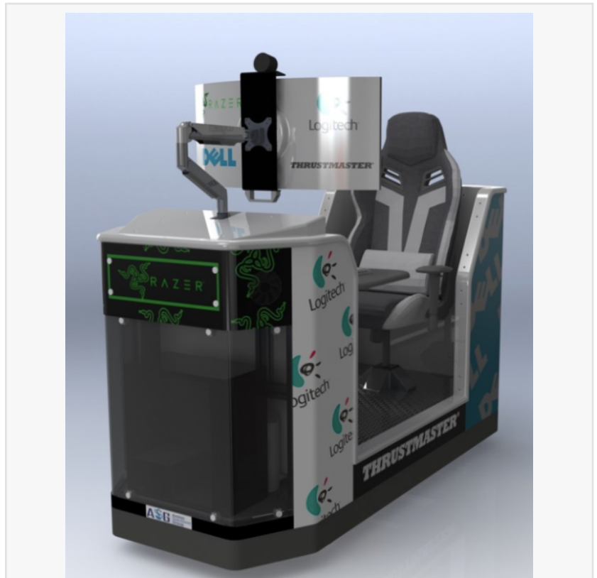
The model setup

Specifically, the Esports Pod holds immense potential in the multi-billion dollar competitive gaming industry and the burgeoning realm of high school and collegiate esports. The innovation sets a new standard for esports gaming. Unlike traditional simulators, each Esports Pod is equipped with standardized internet speed and equipment, emphasizing skill and talent over any advantage of superior software. That is, the Esports Pod paved the way to ensure a level playing field for all participants.