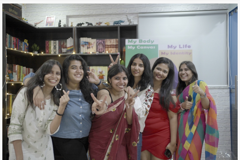
Members of the Girl Power Talk team celebrating Pride at their India offices.

/EINPresswire.com/ -- Blockchain Lex Group is pleased to announce a strategic partnership with consulting firm and social enterprise Girl Power Talk . The collaboration will harness the power of emerging technologies and accelerate impact initiatives for developing the next generation of global leaders. The alliance will integrate legal, financial, and technical expertise while fostering a commitment to more-inclusive work cultures.