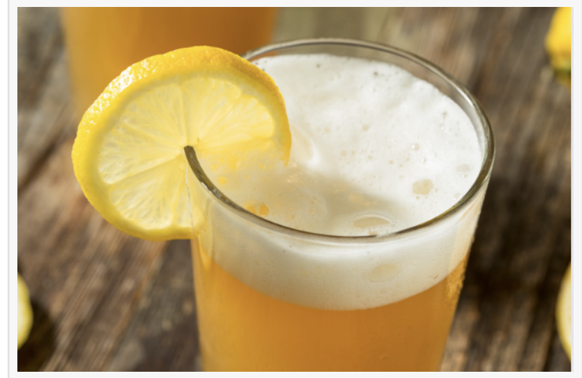
Summer Shandy Special At The Turnhouse Columbia

Whether you're celebrating a special occasion, enjoying a night out with friends, or seeking a cozy date night by one of the fireplaces, The Turn House guarantees not only quality food but also a casual and friendly atmosphere. The restaurant's seasonally inspired and produce-driven menu ensures a superior quality product in every dish.