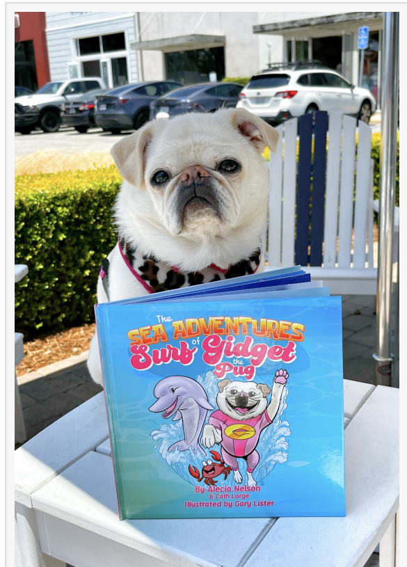
Surf Gidget The Pug

Gidget, a white pug has been surfing for 8 years living in sunny Southern California. She passes the time by hitting the beaches up and down the coast and hanging 10 or maybe 20 and her winning trophies have stacked up over the last 8 years.