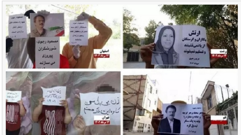
Resistance Units, a network of activists inside Iran affiliated with the People's Mojahedin Organization of Iran (PMOI/MEK), have expanded their activities across the country despite a wave of executions and repressive measures by the regime.

to prosecute 104 MEK members. The regime, which has marked its history with the execution of