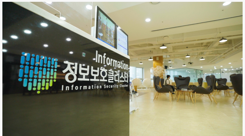
Information security cluster in the 2nd Pangyo Techno Valley