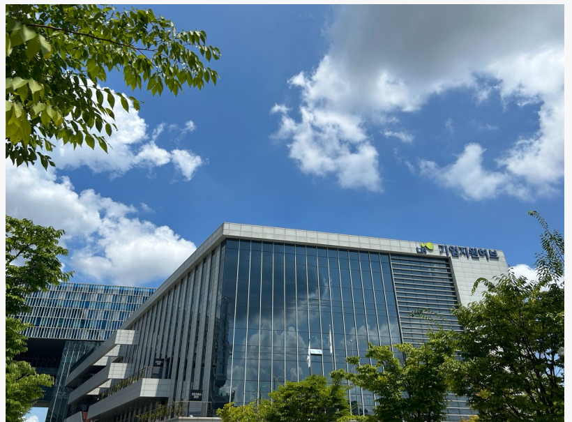
The 2nd Pangyo Corporate Support Hub, a startup incubating space