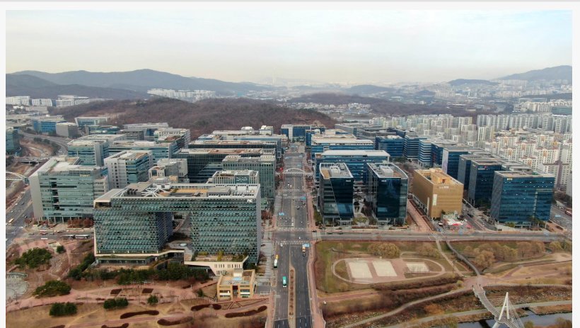
View of Pangyo Techno Valley

Similarly, Gyeonggi Province, centered around Pangyo Techno Valley, has unveiled several strategic initiatives. For example, in 2022, key automotive entities from Gyeonggi Province and