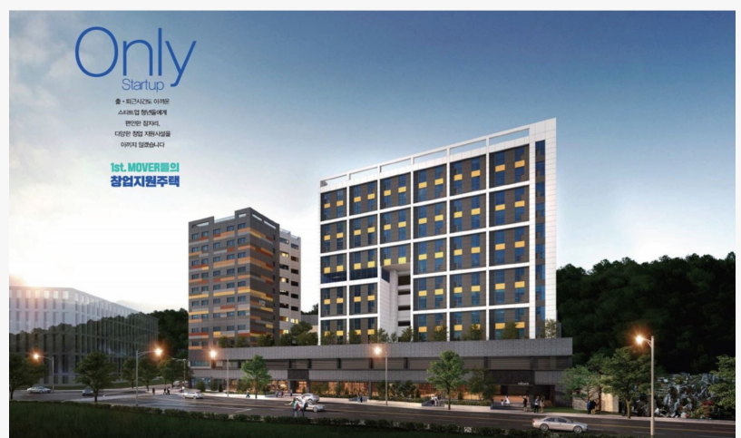
Image of the 2nd Pangyo Techno Valley's A-1BL housing complex

Korea Bio Park, the apex bio venture complex in Pangyo Techno Valley, gives biotech startups access to affordable office spaces. The area's strategic location near renowned global bio-research companies and top-tier hospitals like CHA Bundang Hospital and Seoul National