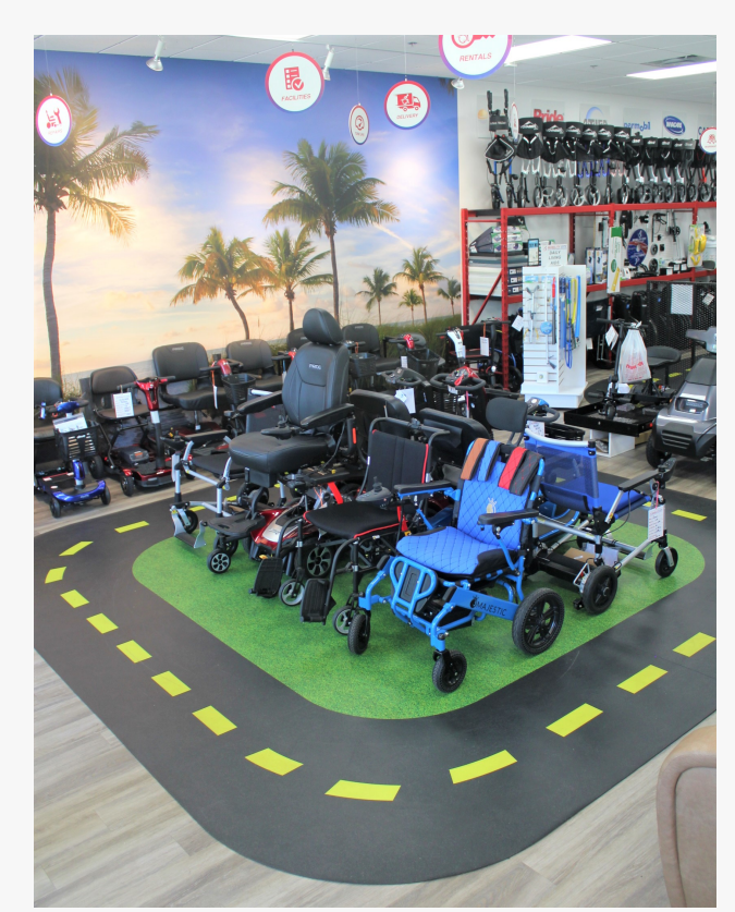
Mobility City of Boca Raton Showroom Floor features a mural, mobility test track, and mobility equipment

With over 39 years of experience in the homecare equipment industry, the company's Technicians are experts at delivering services on-site from a mobile workshop on wheels. Mobility City also services senior communities, assisted livings, nursing homes, hospitals, and the physically impaired at home.