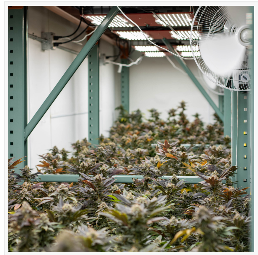
Power Biopharms plants in the flower room

About Prairie View A&M University: Prairie View A&M University is the second-oldest public institution of higher education in the State of Texas. It is a historically black college / university that, since its inception in 1876, has opened its doors to any and