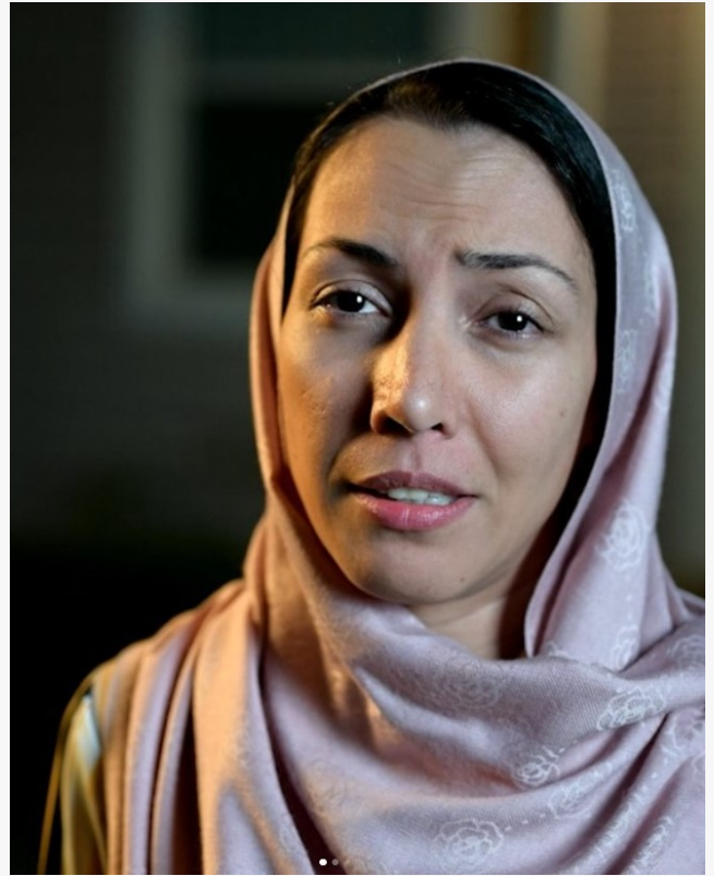
Iranian star Zina Torab stars as Habiba in "I Am Mine Alone"

This press release can be viewed online at: https://www.einpresswire.com/article/649342128