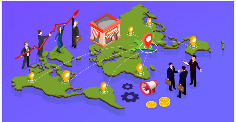
Make in India Pro ascends as a vendor in the world of retail

EAST DELHI, DELHI, INDIA, August 11, 2023 /EINPresswire.com/ -- Localization is the overarching concern of every economy, giving its existing artisans and manufacturers the room to measure growth and give back to the local community without leaning over foreign resources.