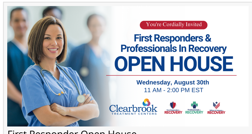
First Responder Open House

BALDWINVILLE, MASSACHUSETTS, USA, August 11, 2023 /EINPresswire.com/ --First Responders & Professionals are the brave souls who stand on the front lines of crisis and disaster every day. They are our firefighters, police officers, paramedics, nurses, doctors, and other emergency personnel who risk their lives to ensure public safety. However, the demanding nature of their work often exposes them to traumatic events, which can lead to stress, anxiety, and unfortunately, mental health issues and/or substance use disorders. The high-stress environment in which they operate often leads to mental health issues such as post-traumatic stress disorder (PTSD), depression, and anxiety. These mental health challenges can sometimes lead to substance misuse as a coping mechanism. This makes it crucial for first responders to have access to specialized addiction treatment that understands their unique needs and experiences.