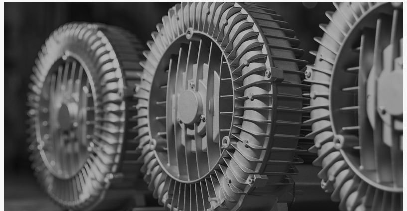
Regenerative blowers Vactegra

Inception of Vactegra's journey occurred in July 2023, driven by a resolute mission: to furnish clients across the United States with the finest vacuum pumps, low-pressure compressors , and essential ancillaries, including an extensive line of regenerative blowers. Among these offerings are the low-pressure regenerative blowers VL , designed to meet a variety of needs. Additionally, Vactegra caters to specific demand applications with its high-pressure models VH , further expanding its ability