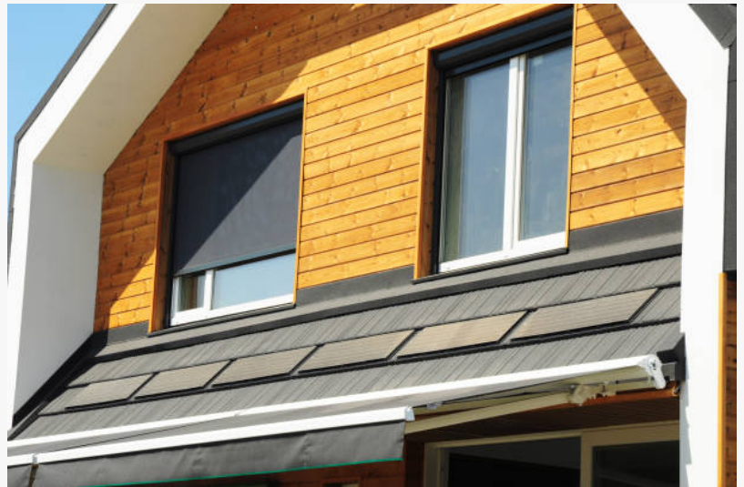
New Tax Rules for Home Renovations

Accessibility Upgrades: Tax incentives have been introduced to support the modification of homes to accommodate disabilities. This includes installing ramps, widening doorways, and other alterations that enhance mobility within the property.