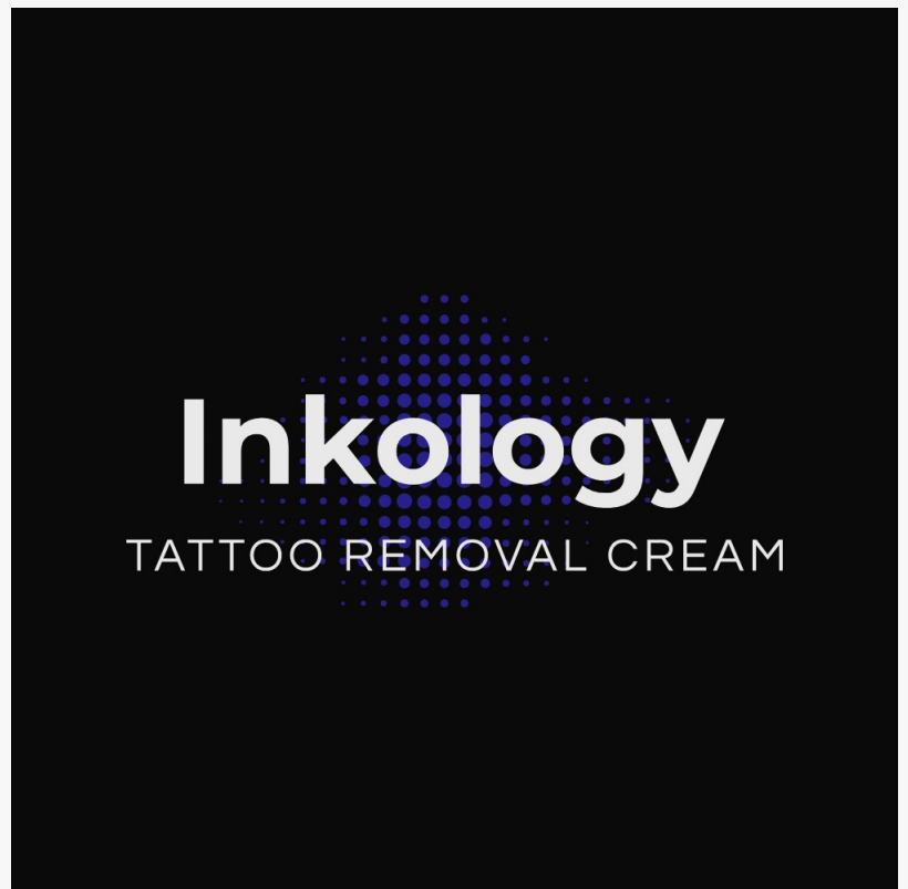
Pain-Free Ink removal

Leading the Revolution in the Tattoo Removal