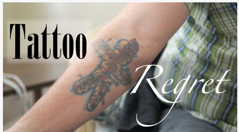
No pain no regret