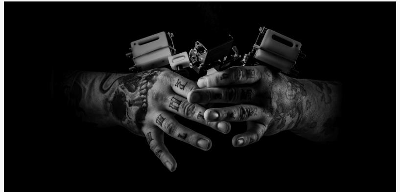
Ink removal in now in your hands