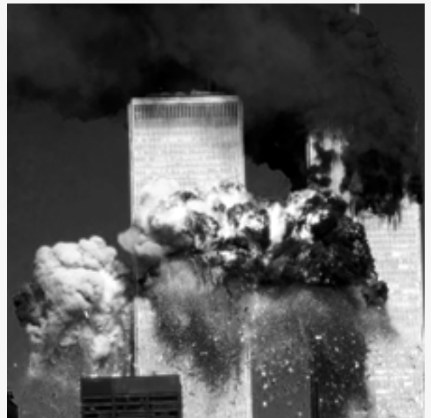
Twin Towers - 9/11