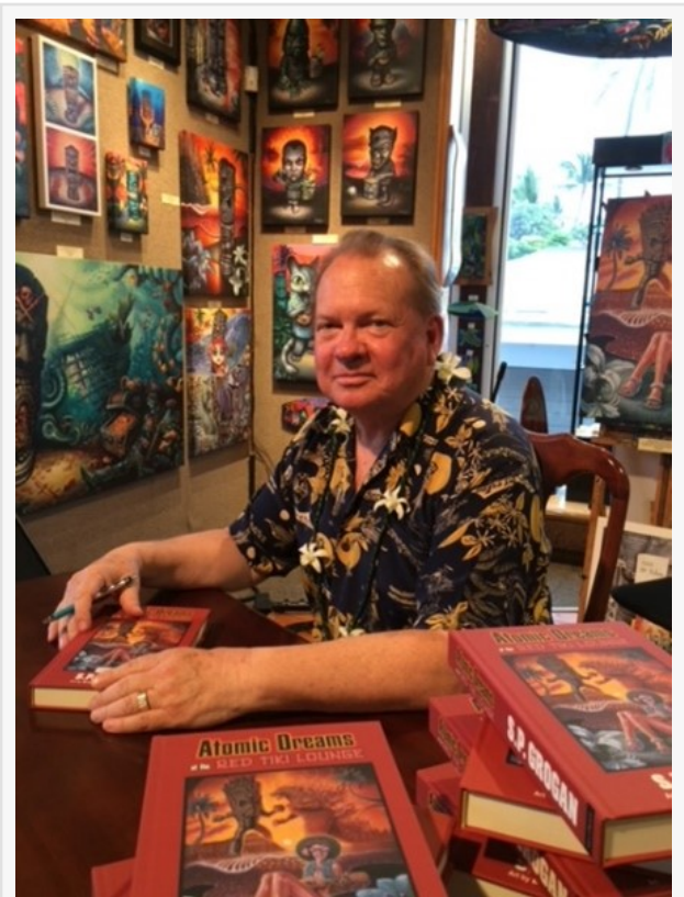
Author SP Grogan