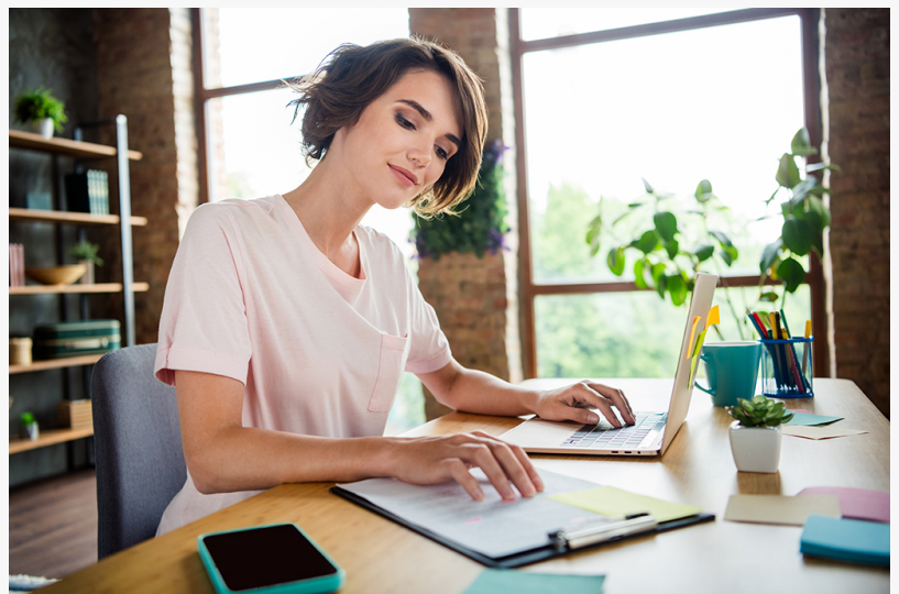
Shop and Compare Electric Plans

When exercising Electric Choice in Texas, Texans can confidently rely on Texas Electric Service. It offers cost-effective, reliable, and environmentally friendly solutions. Opting for TexasElectricService.com provides unparalleled Power to Choose options, spanning Dallas electricity plans , Houston electricity plans , and all other deregulated municipalities throughout Texas.