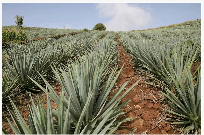
Blue Agave in Negev Desert, Israel

Envisioned as a sustainable group within Israel's Negev Desert, Negave Estates is a distinctive project encompassing organic agave farms, cooperage, and a dedicated distillery. Its primary goal is the crafting of Negave—an exceptional, organic, and kosher agave-based spirit to compete with the finest tequilas and other agave-derived spirits in the world.