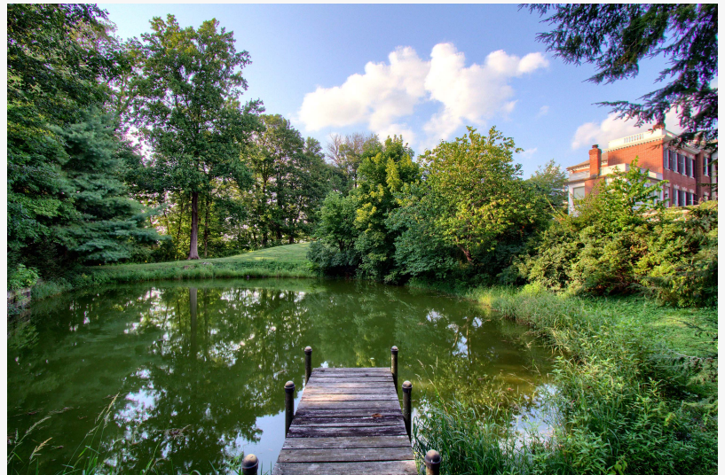
Nearly seven acres overlooking the Ohio River - Luxury Real Estate