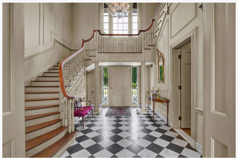
Exquisite finishes adorn a gracious floor plan - Luxury Real Estate

Agents will be compensated according to the terms and conditions of the Listing Agreement. See Auction Terms and Conditions for full details. For more information, including property details, diligence documents, and more, visit ConciergeAuctions.com or call +1.212.202.2940.