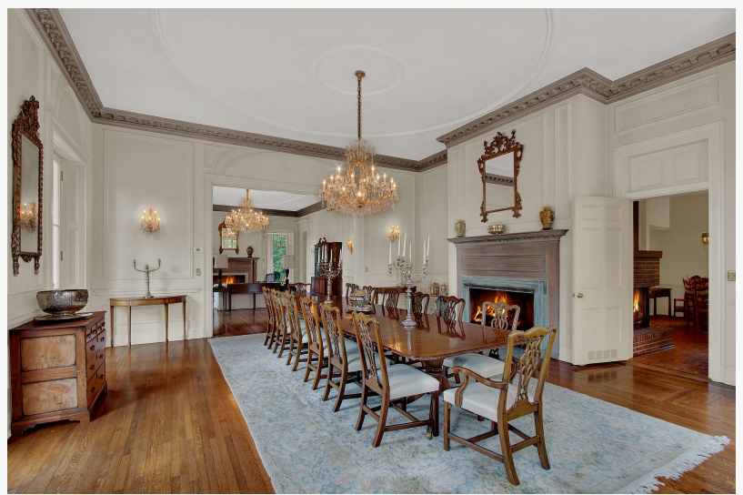
Two notable architects instilled their vision on the estate—Joseph E. Chandler in 1906 and Stratton Hammon in the 1930s - Luxury Real Estate