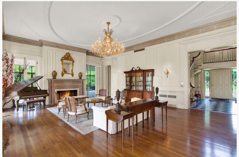
Georgian Revival estate on the National Historic Register - Luxury Real Estate