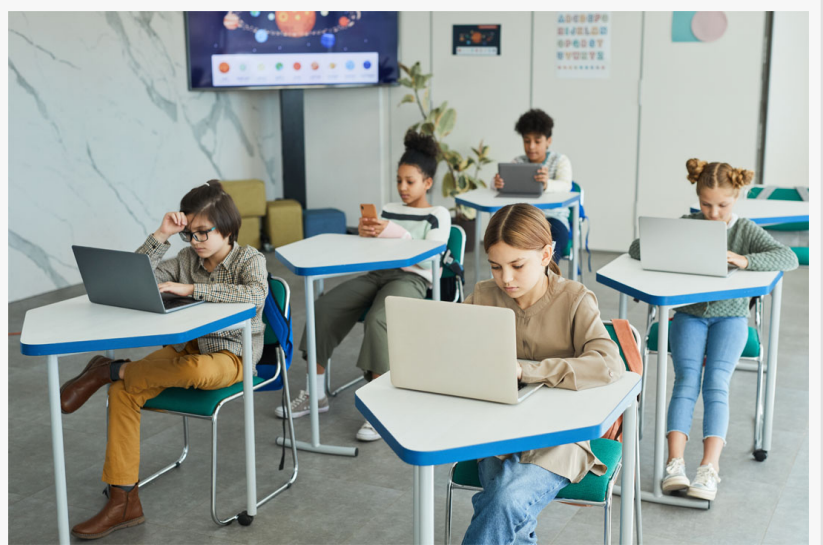
Students using Brainfuse on computers