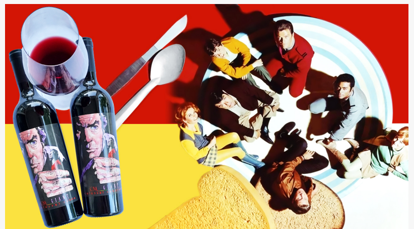
Land of the Giants cast members on a dinner plate with giant spoon and knife