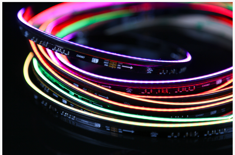
Continuous Side View RGB PixelControl Strip Light emits a continuous line of light from the strip's edge

Continuous Side View RGB PixelControl Strip Light emits a continuous line of light from the strip's edge. The neon-like appearance of the light is only visible when viewed from the side. The extremely narrow profile combined with our patented Continuous Chip-on-Board (COB) technology provides a highly dependable, hotspot-free, discrete lighting solution that can be placed in tight spaces.