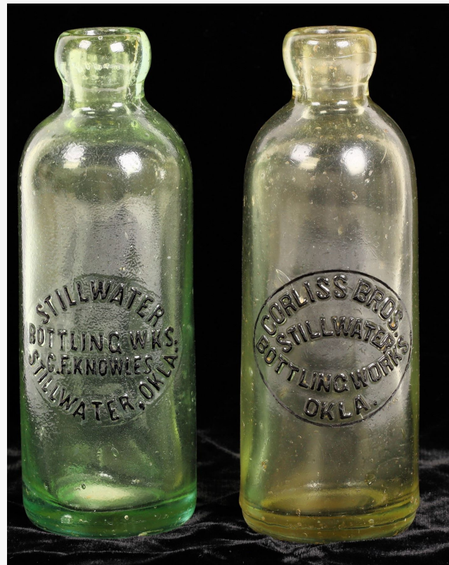
The overall top lot of Day 2 was a pair of very light lime colored Stillwater (Oklahoma) Bottling Works / C. F. Knowles / Corliss Bros. bottles, each one 6 ¾ inches tall ($2,000).