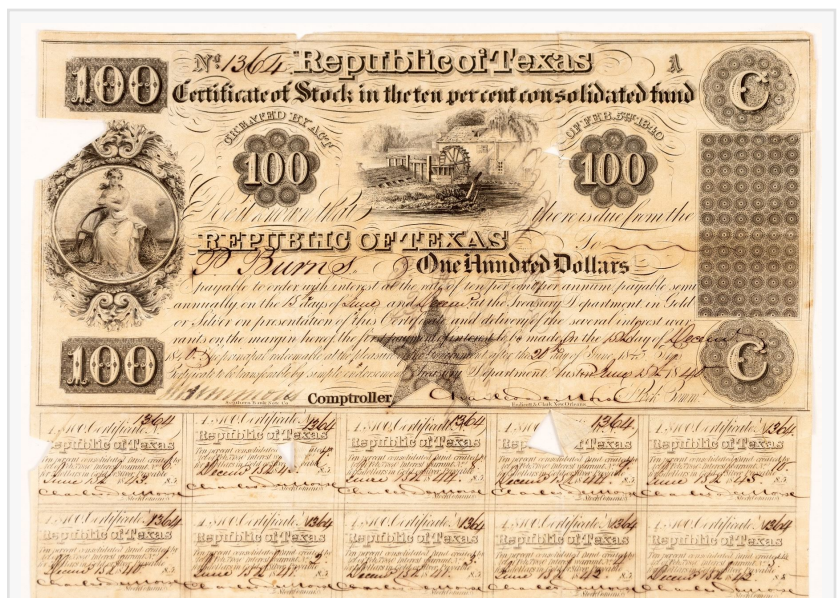
1840 stock certificate from the Republic of Texas, no. 1364, issued to P. Burns for $100, signed by Charles DeMorse as Stock Commissioner, James Wright Simmons as Comptroller ($812.50).

Day 2, on Saturday, July 29th, was packed with more than 750 lots of tobacco and saloon, bottles, firearms and weapons, militaria, political, minerals, mining, stocks and bonds and transportation.