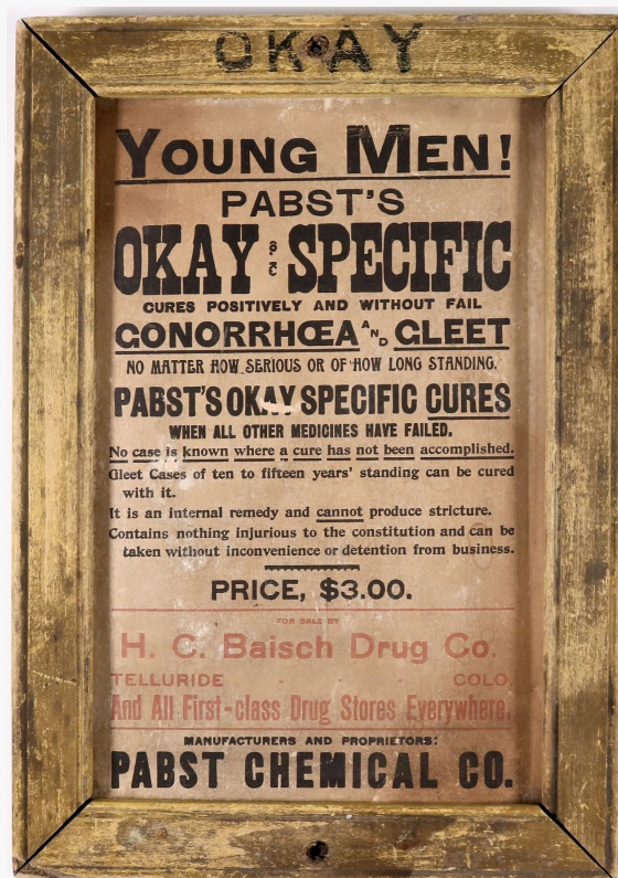
Colorado Pabst Chemical Company cures broadside ("positively and without fail cures gonorrhea and gleet"), housed in a 10 ½ inch by 7 ½ inch frame ($212.50).