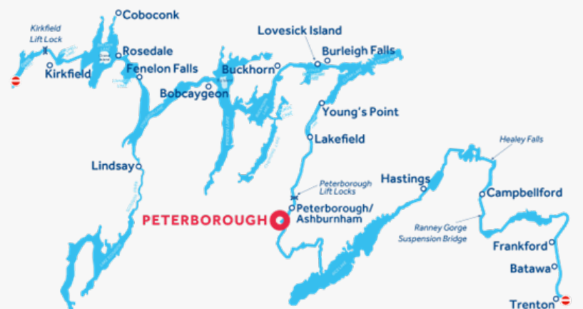
Trent Seven Map