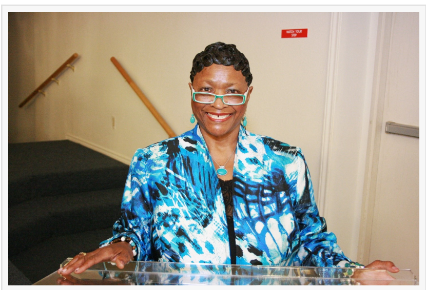
She loves reading and inspires children to read.

She began writing professionally in 1995 and has had several awardwinning poems published. Her first book, It's O.K. To Be Different was written for boys and girls between the ages of nine and fifteen, but it apparently has universal appeal. It has been republished in a New Millennium