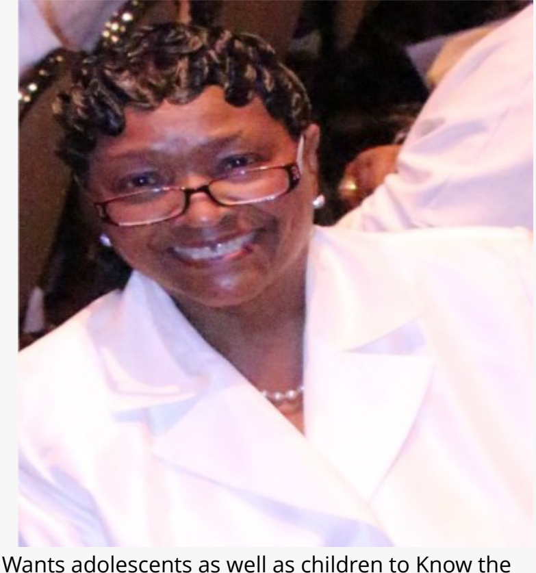
Wants adolescents as well as children to Know the importance of loving and caring for books