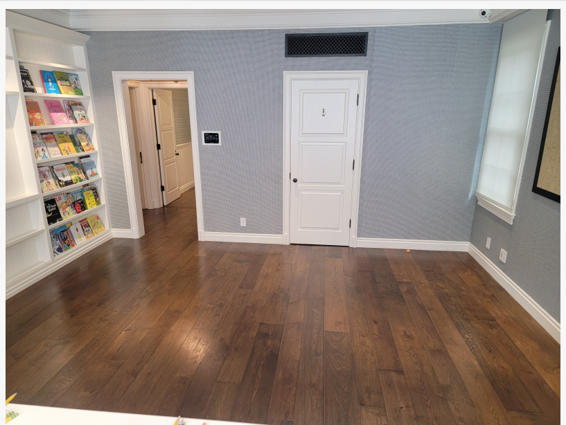
Hardwood Cleaning in Bel Air

To determine the floor's finish, take a sharp knife blade to a small, hidden area of the floor and scrape off a tiny amount of finish. If the scraped material is clear, the floor probably has a surface finish. If scraping the floor finish smudges it, but no clear material comes away, the floor likely has a penetrating finish. Similarly, some floors have a finish baked into them during the manufacturing process. This kind of finish is typical with engineered wood flooring.