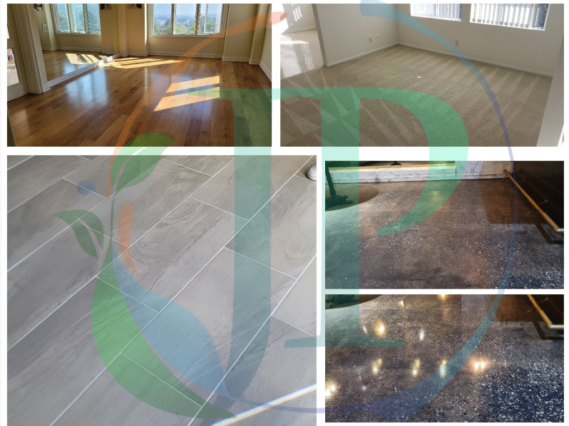
Services JP Carpet Cleaning