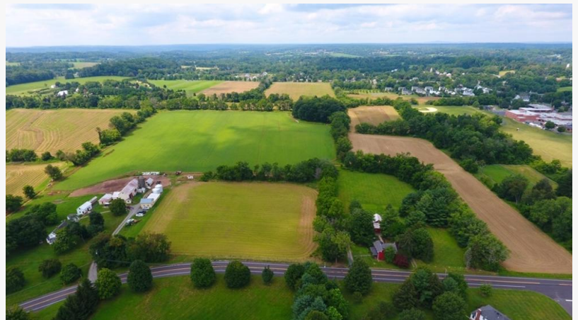
Delaware Twp, Hunterdon Co

accompanied by an 80+/- ft water silo with a capacity of holding 60,000+/- gallons of water. This extraordinary aquifer guarantees sustainable agricultural operations for generations to come and the potential to have a water bottling business. The property highlights not only a charming c. 1800's four-bedroom colonial home but also essential farm infrastructure. This includes a former dairy barn, storage sheds, a pool shed, and a spacious 50'x80' barn featuring oil heating, electric supply, 16' ceilings, and oversized access doors. These structures offer abundant space for storing and maintaining farm equipment, and fulfilling the practical requirements of any farm operation. The Beatty Farm's diverse landscape harmoniously blends cropland, pastures, and wooded areas. Recognized as a Dairy of Distinction Farm in the past, this cherished land currently thrives as a cattle and crop farm, rendering it a highly appealing investment opportunity within the farming community. Property Previews are scheduled from 12:00-noon to 2:00 p.m. on Saturday, August 26th and Tuesday, August 29th.