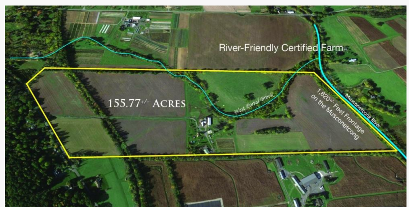
Bethlehem Twp, Hunterdon Co

• “Beatty Farm” Bethlehem Township , NJ: A Water-Rich Agricultural Gem Nestled alongside the scenic Musconetcong River in Bethlehem Township, Hunterdon County, the awe-inspiring "Beatty Farm" spans an impressive 155.77+/- acres and will be sold by an online auction concluding Thursday, September 14th at 11:00AM. This remarkable preserved farm is renowned for its robust aquifer,