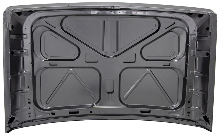
Hood - OE Style - 67-72 Ford F100 F250 F350 - Underside View

This press release can be viewed online at: https://www.einpresswire.com/article/650066580