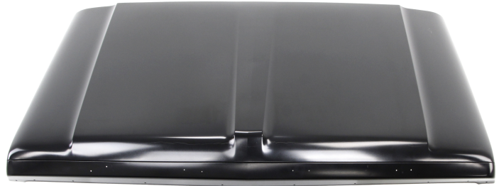
Hood - OE Style - 67-72 Ford F100 F250 F350 - Front View