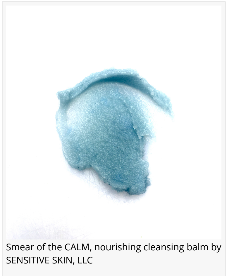
Smear of the CALM, nourishing cleansing balm by SENSITIVE SKIN, LLC

The CALM Nourishing Cleansing Balm emerges as a beacon of hope for those navigating the complexities of sensitive skin. Its alchemical blend, enriched with Blue Tansy Oil, Bisabolol, Elderberry Fruit Extract, Mango Butter, Pomegranate Extract, and White Willow Bark, promises a transformative experience. CALM isn't just a skincare product; it's an invitation to explore the delicate balance between skin and soul.