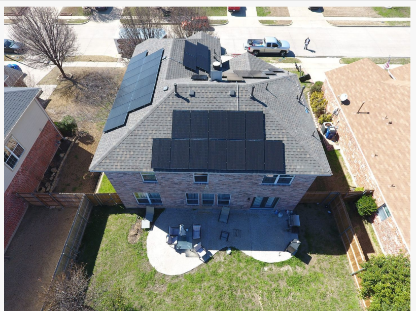
GHS Solar Installation in Watauga, TX

Green Home Systems stands out with their steadfast dedication to putting customers first. Through their provision of state-of-the-art solar technologies, transparent pricing models, and a strong commitment to energy efficiency, Green Home Systems has successfully guided countless of Texas homeowners in their shift towards clean, renewable energy sources, resulting in significant savings on their energy bills.