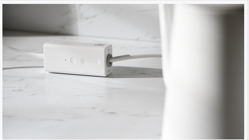
EVVR Smart Plug works with Apple Home

“EVVR Smart Plug could be used in more scenarios than you can imagine! It is my pleasure to inform you that you