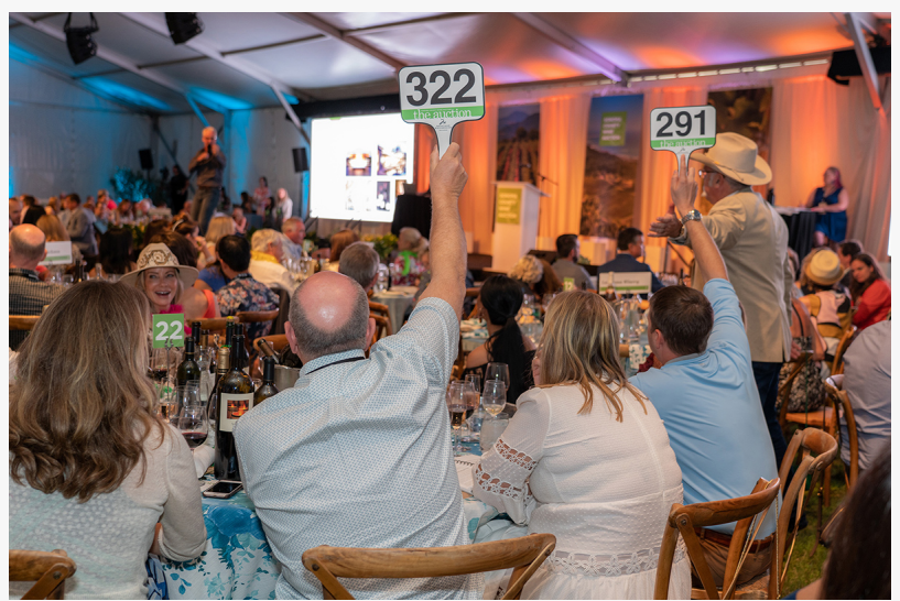
Bidders compete for spectacular wines and experiences at Sonoma County Wine Auction.

Every year, a critical fundraising lot is the Fund-A-Need Paddle Raise. This powerful collective giving opportunity raises funds for children’s education and literacy while also addressing new challenges the county faces.