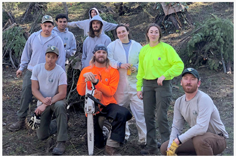
Sonoma County Regional Parks Foundation Youth Crew