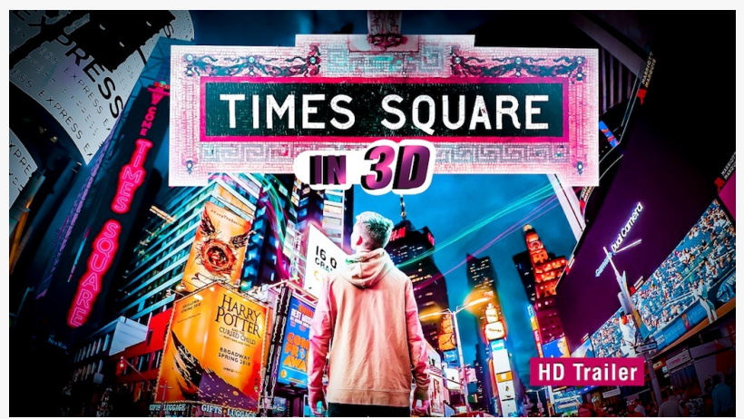
Times Square In 3D - HD Trailer on YouTube