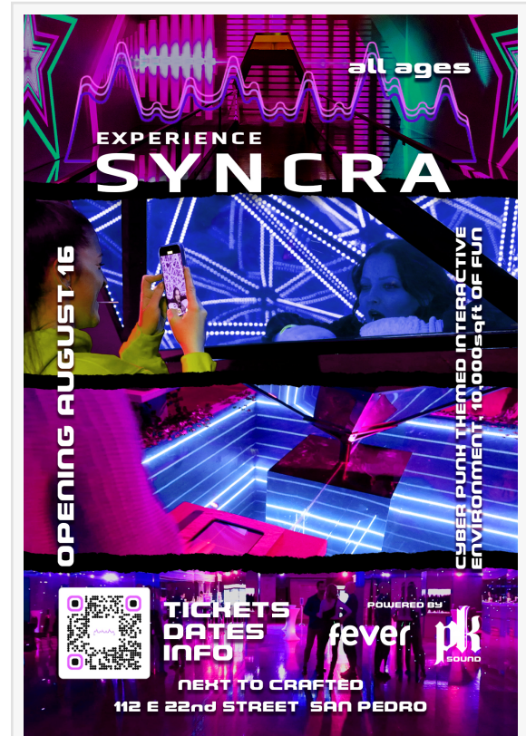
Syncra - an all ages experience

His team of projection mapping artists have animated a visual canvas, and their expert team of coders, programmers, and lighting designers collaborated to make this an incredible interactive audio-visual walkthrough adventure!