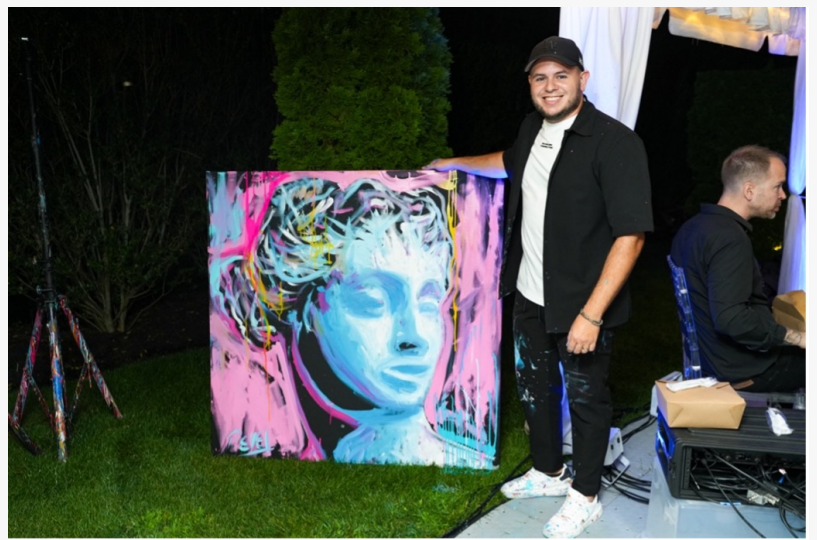
Revel, Artist