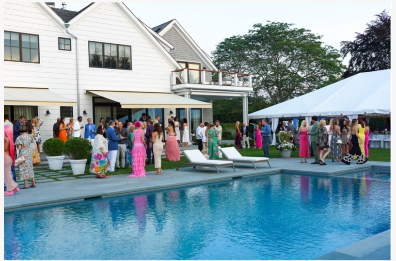
Atmosphere

This press release can be viewed online at: https://www.einpresswire.com/article/650299448 EIN Presswire's priority is source transparency. We do not allow opaque clients, and our editors try to be careful about weeding out false and misleading content. As a user, if you see something we have missed, please do bring it to our attention. Your help is welcome. EIN Presswire, Everyone's Internet News Presswire™, tries to define some of the boundaries that are reasonable in today's world. Please see our Editorial Guidelines for more information. © 1995-2023 Newsmatics Inc. All Right Reserved.