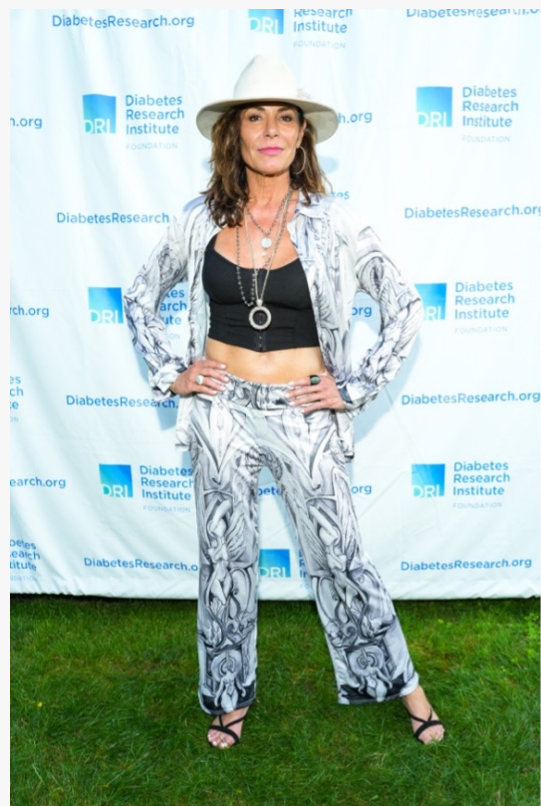
Luann de Lesseps