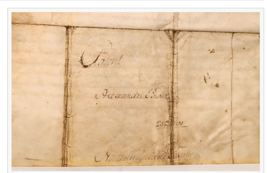
30 inch by 30 inch land deed signed by Benjamin Franklin, dated April 11, 1787, for 282 acres of land known as "Powersburg" in Pennsylvania (est. $25,000-$50,000).

RENO, NV, UNITED STATES, August 17, 2023 /EINPresswire.com/ -- Holabird Western Americana Collections will bid farewell to summer with a premier four-day "Raise a Glass to Yesteryear" auction Thursday thru Sunday, August 24th-27th, online and live in the Reno gallery located at 3555 Airway Drive. Start times all four days are 8 am Pacific time. Online bidding is via iCollector.com, LiveAuctioneers.com and Invaluable.com.