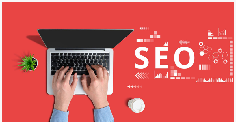
Local Search Engine Optimization Services