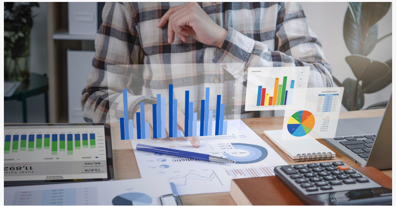
West Palm Beach SEO Services

"Technology allows companies to work smarter, faster, and more productively than ever before. But it also requires constant maintenance, monitoring, and strategic optimization to deliver on that promise," says CEO of Blue Logic IT. "Our managed IT services empower businesses to get the most out of their tech investments by taking IT operations off their plates. That allows them to dedicate their resources to growth, innovation, and serving customers, while we handle the technology that makes it happen behind the scenes."