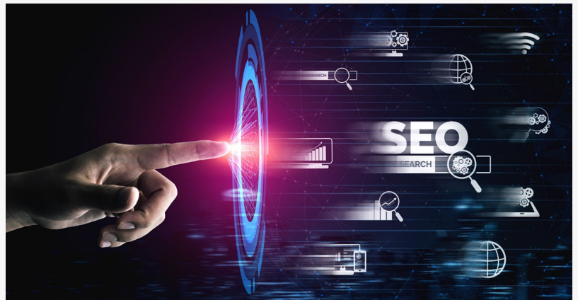
Blue Logic IT Solutions - SEO Services in West Palm Beach

"Cyberattacks and data breaches can devastate small and mid-sized businesses lacking strong IT security and expertise," cautions the CEO. "Our cybersecurity services are designed to prevent that by identifying risks, blocking threats, continuously strengthening defenses, and ensuring regulatory compliance."