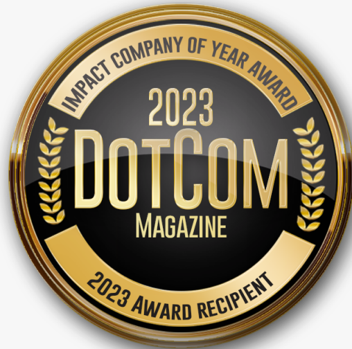
The DotCom Magazine Entrepreneur Spotlight Series- Impact Company

DotCom Magazine is a leading news platform providing fascinating interviews with news makers, thought leaders, and entrepreneurs. DotCom Magazine is the leader in putting people with insatiable entrepreneurial spirit at the forefront of every story it covers. The Entrepreneur Spotlight Interview Video Series looks at business through the lens of a successful entrepreneur's mindset. The Entrepreneur Spotlight Series has included high-profile leaders, including Inc 500 founders, Ted Talk presenters, ABC Shark Tank participants, venture backed visionaries, prolific CEO's and Founders, and many other wonderful thought leaders and