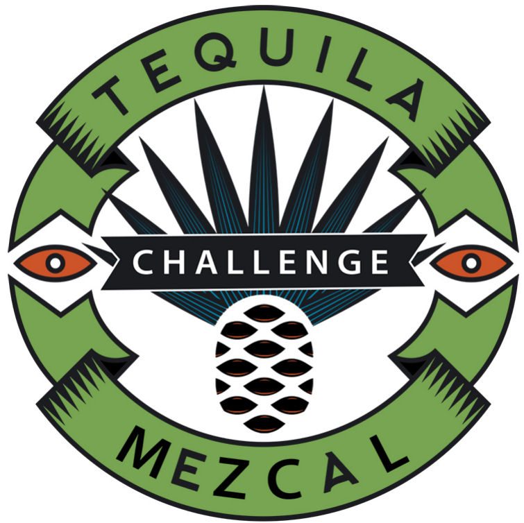
Tequila Mezcal Challenge logo

The Tequila Mezcal Challenge welcomes entries from artisanal producers (5,000 bottles or less) and commercial bottlers. The judging team comprises some of the world's most seasoned tequila and mezcal experts. They understand and respect the work that goes into the entire