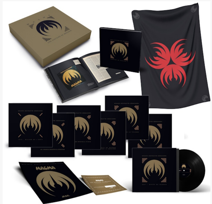
Magma - Une histoire de Mekanik – 50 Years of Mekanik Destruktiiv Kommandöh

Iconic French avant-garde rockers MAGMA have joined forces with Prophecy Productions to create a lavish boxed set under exclusive license from Seventh Records to celebrate the 50th