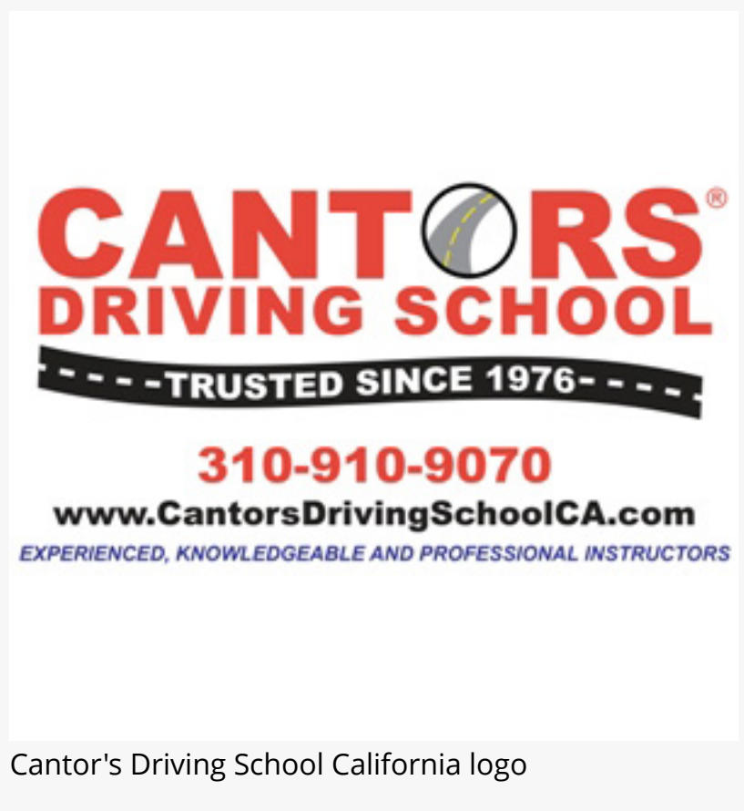
Cantor's Driving School California logo

For more information or to inquire about driving lessons, please call 310-910-9070 or visit the