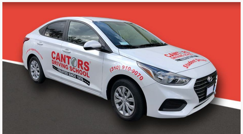
Cantor's Driving School Driver Training Car

to increased demand for driving lessons at Cantor's Driving School's Orange County location and throughout the Southern California.