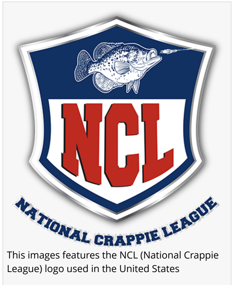
This image features the NCL (National Crappie League) logo used in the United States

High-quality local hotels are ready to welcome guests, ensuring they experience the best of what the Lake has to offer.