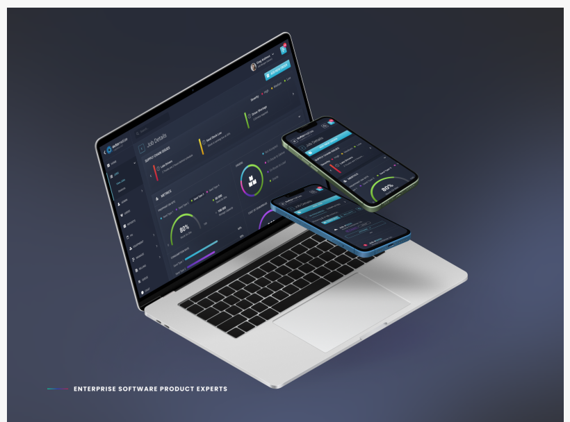
Enterprise Software Design and Development Agency

Companies on the 2023 Inc. 5000 are ranked according to percentage revenue growth from 2019 to 2022. To qualify, companies must have been founded and generating revenue by March 31, 2019. They must be U.S.-based, privately held, for-profit, and independent—not subsidiaries or