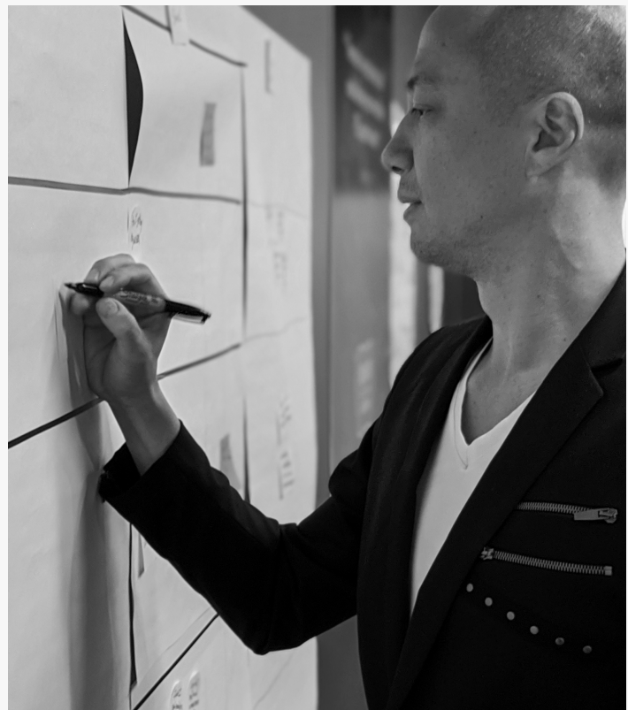
Digital Transformation workshop by IIIMPACT