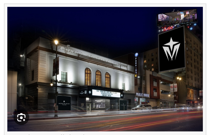
Ricardo Montalbán Theatre

HOLLYWOOD, CA, USA, August 21, 2023 /EINPresswire.com/ -- Rock the Shorts Film Festival, celebrating short films across animation, documentary, drama, comedy, thriller/horror and international categories will be live on the Rooftop of The Montalbán Theatre in Hollywood this Labor Day, September 4, 2023! Filmmakers and their short films will be celebrated