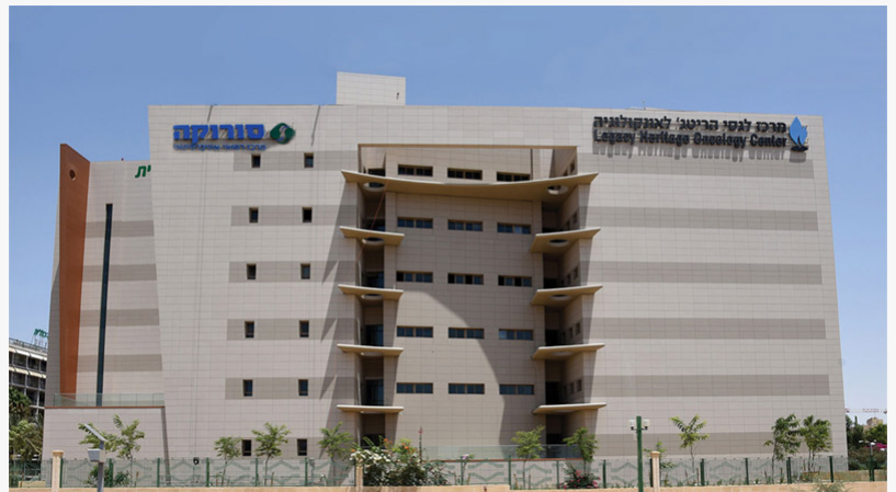
The Legacy Heritage Oncology Center & Dr. Larry Norton Institute at Soroka Medical Center