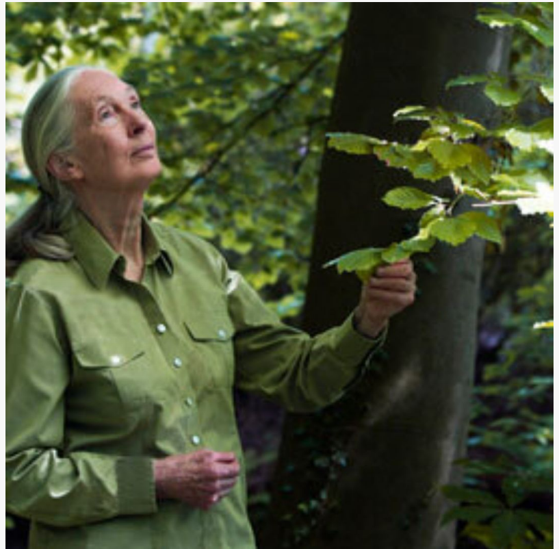
Dr. Jane Goodall partners with ReWorld for true conservation.