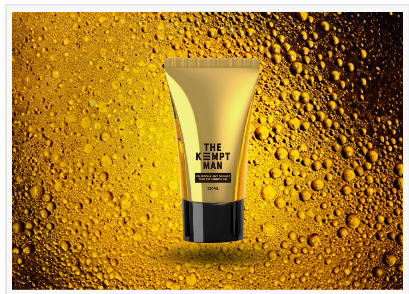
The Kempt man product

This press release can be viewed online at: https://www.einpresswire.com/article/650897575