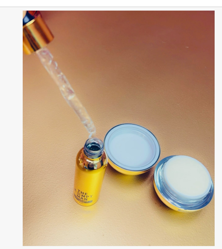
The Kempt man Daytime Cream and 24k gold serum