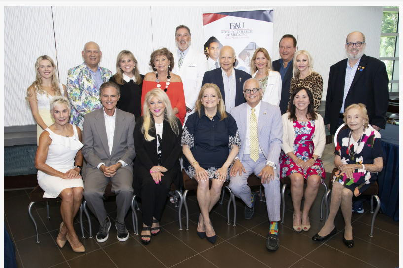
2023 White Coats-4-Care Committee