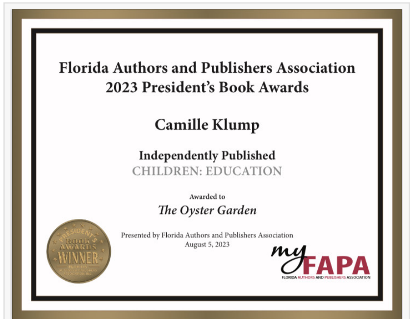
Bronze Medal For The Oyster Garden

It is available on Amazon in the United States, and the United Kingdom, https://www.amazon.com/OYSTER-GARDEN-CAMILLE-KLUMP/dp/BOC128V28N/ You can also purchase through the author's website https://www.camilleklump.com or through Barnes and